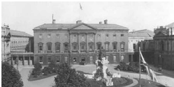
< Leinster House in 1911, decorated for the visit of King George V .

http://www.answers.com/topic/leinster-house