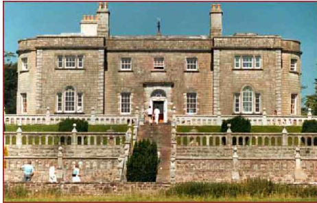
< Belvedere House