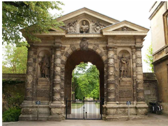
Gate of the Physick Garden

GLORIAE DEI, OPTIMI, MAXIMI, HONORI CAROLI REGIS, IN USUM ACADAMIAE ET REIPUBLICAE, ANNO 1632. HENRICUS COMES DANBY.